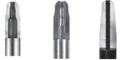
3/8" .080" WALL 3/8" .135" WALL 7/16" .165" WALL